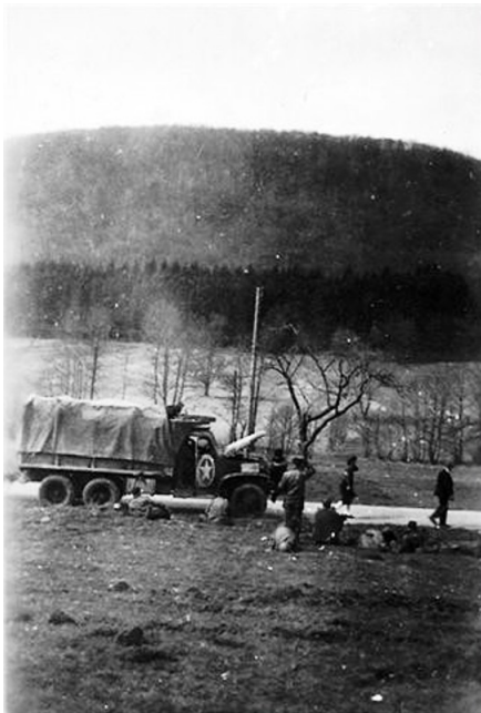
2 1/2 ton Truck Broken Down.