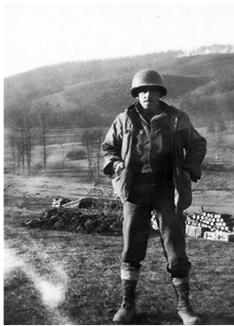
Unknown Soldier of Battery C