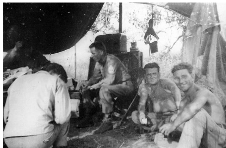
Battery's First Sergeant at Work.