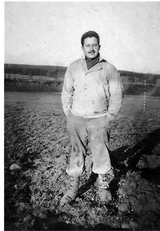
Unknown Soldier of Battery C