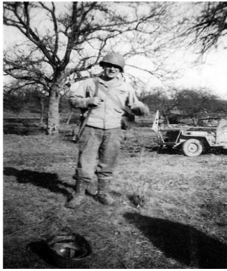
Unknown Soldier of Battery C.