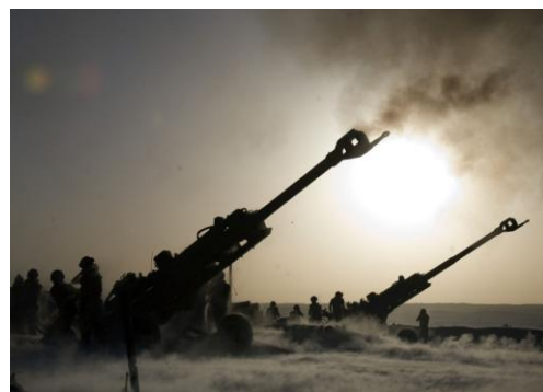
M777s in Afghanistan

So it seems that the “Unheard Third” has always been there ready for recall during periods of crisis and war. And, like the other battalions of the regiment, served honorably, heroically and with great distinction. The 3/17 th FA deactivated in 2010. But, as with Desert Storm, I will let its story be told by its veterans—some of which are members of our great association. The flag has been passed!