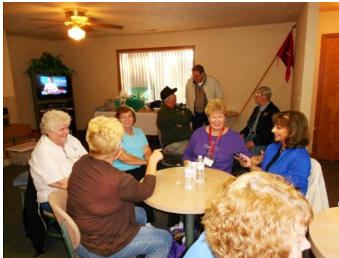
Ladies at Branson 2012