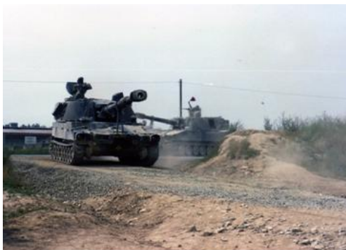
3/17 FA “Hip Shoot” at Grafenwohr, 1989

We were also re-designated at the same time as a sister battalion of the regiment, the 5 th Battalion, 17 th FA an 8” M110A2 battalion also of the 210 th FA Brigade, stationed at Herzo Base (we referred to it as Bozo Base!). Again, not to offend those members of the Association that served on 8” howitzers, we considered the 5/17 th a competitor and derisively referred to them as a M110 “Towed” Battalion as the M110’s maintenance reputation was just not as good as the M109’s. In fact, we considered an 8” tube raised high with engine grill doors open while parked aside a tank trail at Grafenwohr as the “International Symbol of Howitzer in Distress”