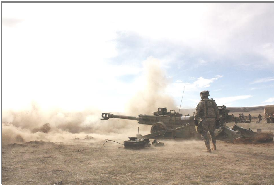
Direct fire from a M777A2 (155mm) howitzer of Bravo Battery, 2nd Battalion, 17th Field Artillery Regiment, 2nd Brigade Combat Team, 2nd Infantry Division during training at Yakima Training Center, Washington, March 2014