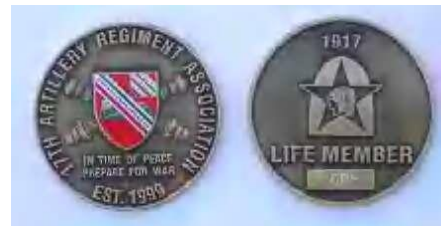
17th Artillery Regiment Association Life Members