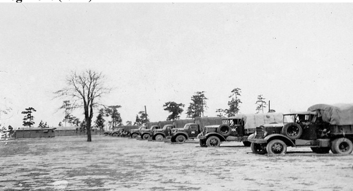
Truck Park – 17 th Field Artillery Regiment (1941)

*It should be noted that the French built stubby box-trail Schneider 155mm Howitzers was the same howitzer used by the regiment during World War I and arrived from Camp Travis, Texas to Camp Bragg, North Carolina in 1921. The World War I – vintage Schneider after some modification was used by the regiment during the first years in World War II, although the 2 nd Battalion (Batteries D, E, & F) lost all of their Schneider Howitzers, on February 24, 1943, after being attacked by the 10 th Panzer Division at Faïd Pass, Tunisia.