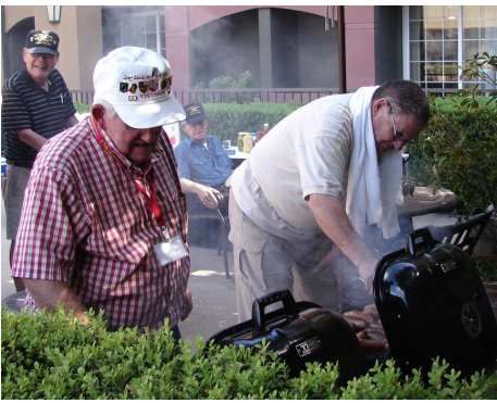
The Three cooks and supervisor sitting