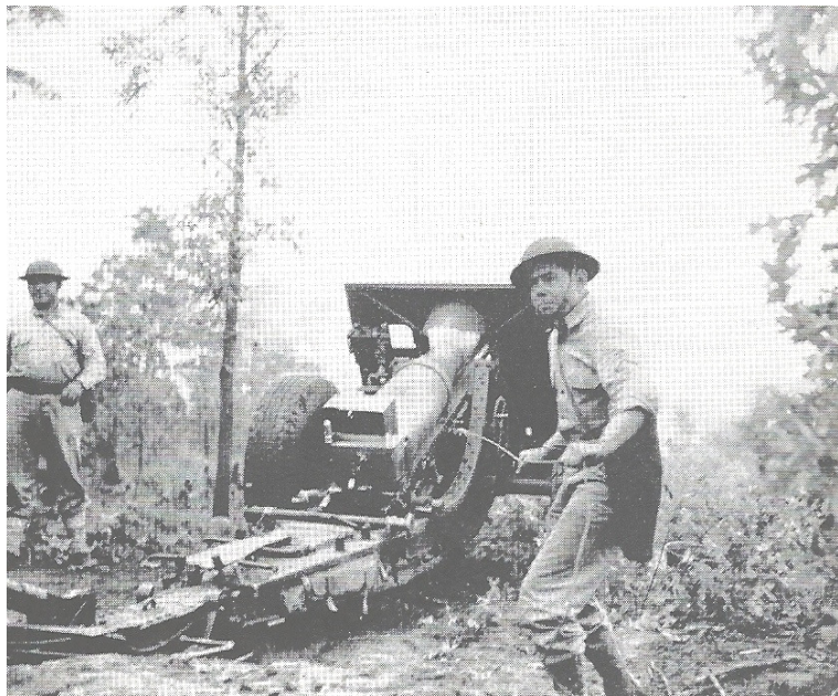
Soldiers of the 17th Field Artillery Regiment fire their 155mm howitzer. Picture from the Historical and Pictorial Review: Seventeenth Field Artillery, United States Army, Fort Bragg, N. C. 1941