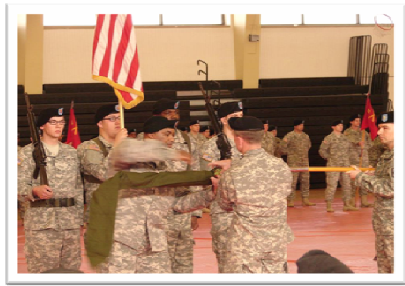
The cloaking of the Battalion's Colors

The 1st Battalion, 17th Field Artillery Regiment deactivation ceremony was held at the Fort Sill Rinehart Fitness Center on December 11, 2013.