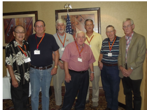
The seven IaDrang Warriors