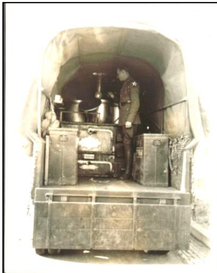
Signal Corps Photo 98220 – Kitchen Truck for the light truck drawn battery