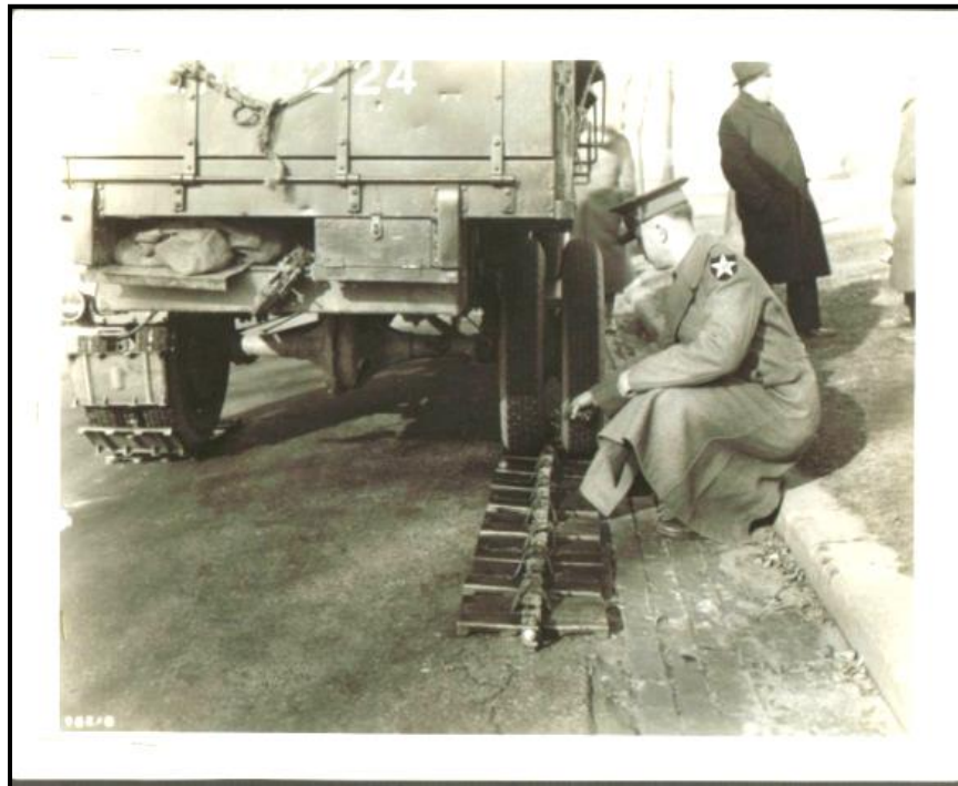
Signal Corps Photo 98218 – Light Truck Battery with Hipkins Track, the Hipkins traction device was developed by MR. O. F. Hipkins as means of increasing the traction of Ford and Chevrolet trucks on muddy roads and across country