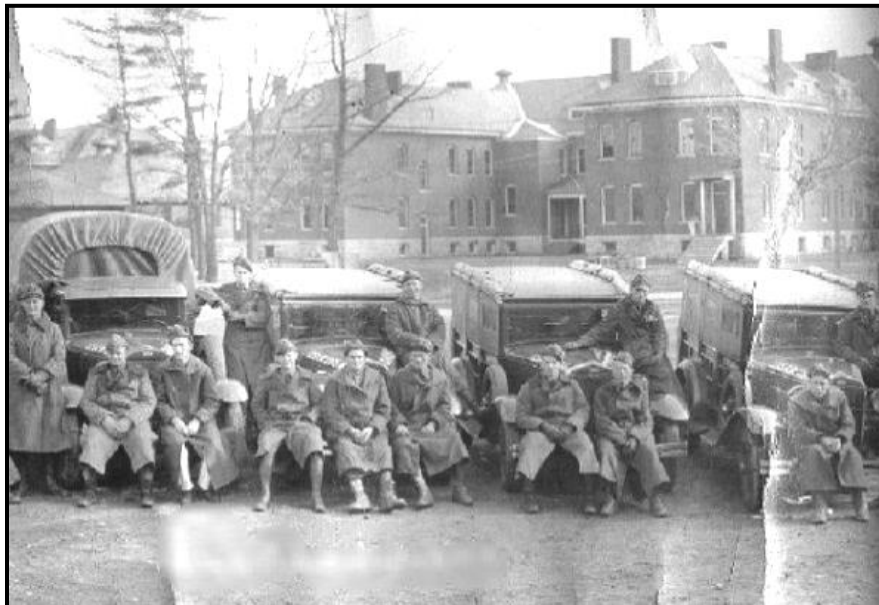
Soldiers of Battery D, at Fort Ethan Allen, New Hampshire for winter testing of the light battery, January 1933-