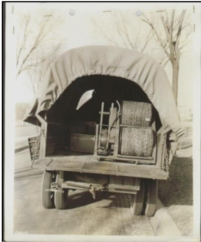
Signal Corps Photo 98213 – Wire Truck, Light Battery with RL139. The RL139 could fit on any truck of the light truck drawn battery.

On the road trip to Fort Ethan Allen road conditions varied from solid ice, on steep winding roads, with other roads deeply rutted, and frozen hard with and without snow, to clay roads with surface made slippery by rain and thawing.